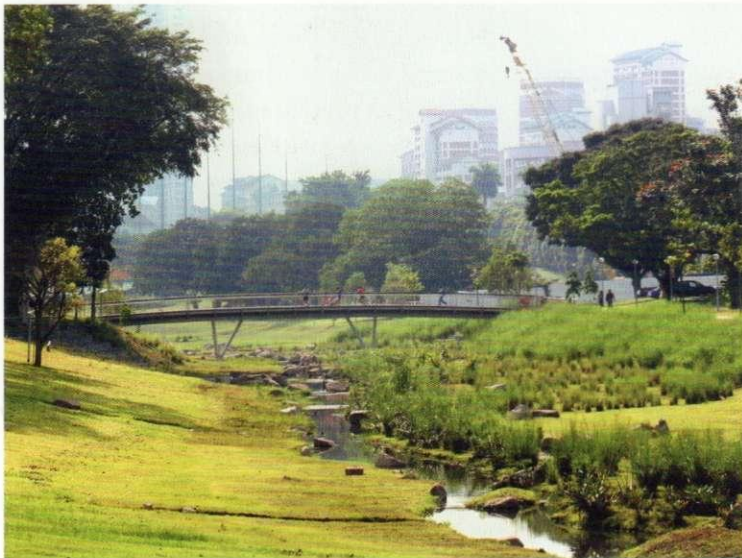
16 Bishan-Ang Mo Kio Park in the Asian metropolis Singapore is an example of integrated infrastructure management in a dense neighbourhood.

Cover: Water experiment for public participation in urban design workshops Design: Herbert Dreiseitl