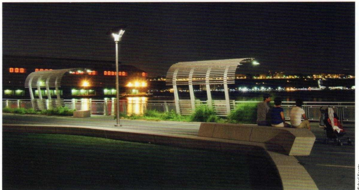
88 Riverside Park South along the west side of Manhattan provides a network of boardwalks and promenades with views to the Hudson River.